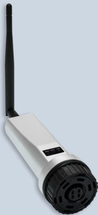
Data Logging Stick S3-GPRS-ST