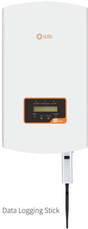
Data Logging Stick