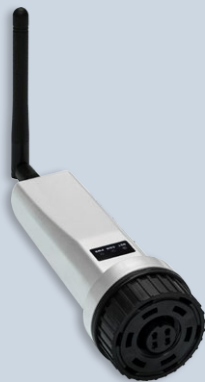
Data Logging Stick S3-WiFi-ST